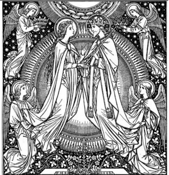
The Solemnity of the Assumption Of the Blessed Virgin Mary Wednesday, August 15 th , 2018